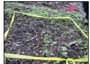
Our Garlic mustard study plot behind Fireweed Place.

Beginning in early July, JWP staff launched the Lower Jordan Creek Stormwater Mapping effort. With help from the CBJ and the Juneau office of the Fish and Wildlife Service, JWP will be mapping impervious area, land use, and stormwater treatment/conveyance in the lower Jordan Creek watershed for the benefit of salmon and resident fish populations. Mapping drainage areas and stormwater outfalls in Jordan Creek will direct our attention to areas where a little investment in additional treatment or the installation of additional storm water BMPs will go a long way toward improving water quality.