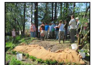
More funding means more projects like this 2010 Jordan Creek re-vegetation workshop.

Fundraising efforts for this fiscal year are ongoing and we always will welcome project and program ideas from the community. We cannot thank our funders and our members enough for their guidance and support of our work. More information on these projects can be found at: www.juneauwatersheds.org .