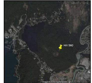
Hill 560 as seen from Google Earth

Working closely with the City and Borough of Juneau, JWP staff will assess "Hill 560" - a topographic rise adjacent to the eastern shore of Auke Lake - in order to provide recommendations for the maintenance of watershed and habitat integrity for any future development in this area. We will use in-field assessments and GIS analysis to recommend appropriate conservation and riparian easements, watershed-boundary-conscious drainage planning, stormwater management, and the minimization of impervious areas and wetland fill.