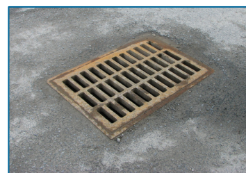
A very simple stormwater conveyance in the Lemon Creek area. September 2007.

The final goal of this project is to provide the CBJ with a comprehensive stormwater map to help guide "smart" development on CBJ lands. We are excited about working on this project this year. Stay tuned to hear more about this project in the future.