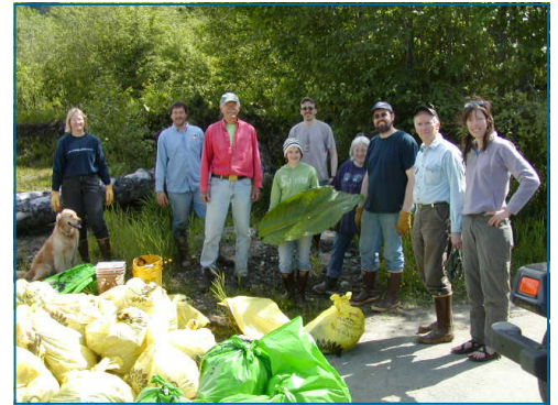
Local heroes from Alaskan Brewing Co. and the CBJ pose next to the garbage and recycling they hauled out of Vanderbilt Creek in June 2007.

You can make a difference in Juneau by raising your concerns and voicing your suggestions on how we can work together to maintain healthy watersheds. Won't you join us?