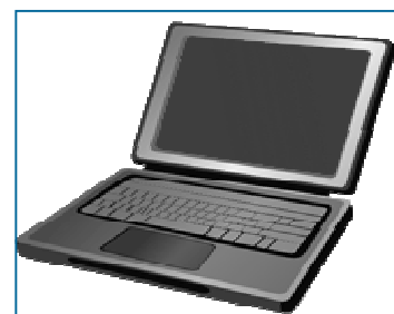
Check us out on the web: www.juneauwatersheds.org

If you enjoy scanning documents, we could use your help. Call us at 586-6853 if you have some time to come in and scan. You might learn something new, too.