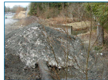
A pile of sediment left behind from snow storage on Duck Creek. April 2007.

For more information on BMP's for snow management, check out our website at: www.juneauwatersheds.org .